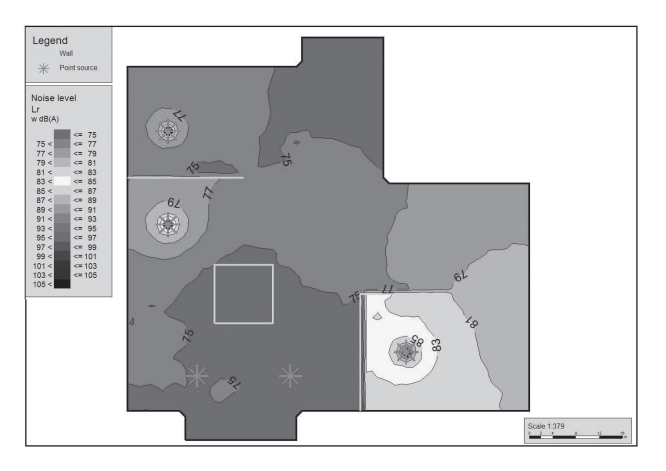
Fig. 4. Distribution of the acoustic field - variant 17.