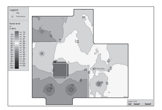
Fig. 3. Distribution of the acoustic field - variant 14.